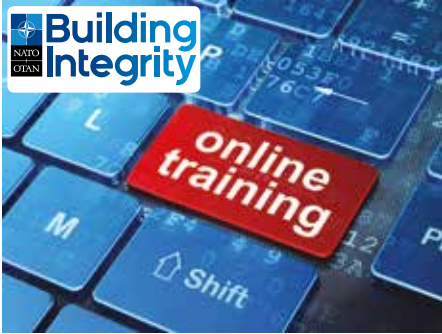
NATO Building Integrity Awareness Course.

The effects of corruption on a mission need to be addressed through a comprehensive programme of Building Integrity training and education. This also promotes transparency, accountability and integrity. In NATO, training is a national responsibility, but nations need to provide all personnel with a basic understanding of the impact of corruption 8 . Nations and NATO also need to develop subject matter expertise on countering corruption. Staff involved in activities at risk of corruption, should increase their individual awareness of “corruption risk”, through activities such as: